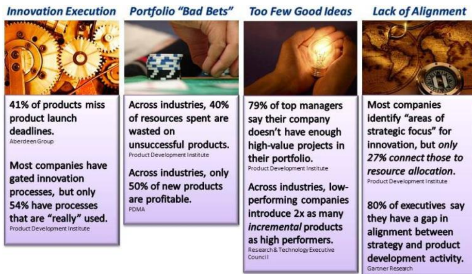
Figure 1: Barriers to Innovation Success. Sopheon’s research and experience have determined that there are four primary reasons consumer goods companies struggle in the pursuit of their innovation objectives.

This paper is the first in a series focused on the unique challenges facing consumer goods firms in their efforts to achieve profitable, revenue-generating product innovation. For most CPG manufacturers, the base innovation methodology is the gated process. Our experience indicates that even leading consumer goods companies sometimes have a hard time operating these processes effectively. This paper offers principles and best practices for surmounting the barriers or road blocks that can interfere with successful gated process execution.